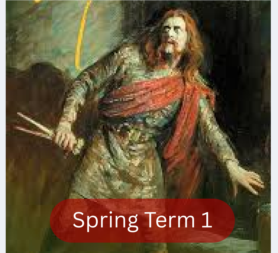
Spring Term 1

Knowledge I will consolidate my knowledge of the exam paper. I will revisit and consolidate learning of plot, characters, themes, context. I will continue to revise and understand key quotes with analysis.