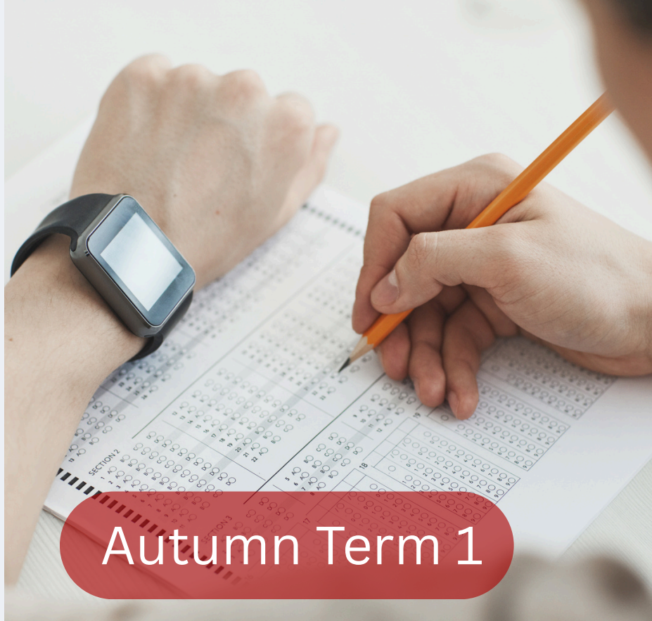
Autumn Term 1