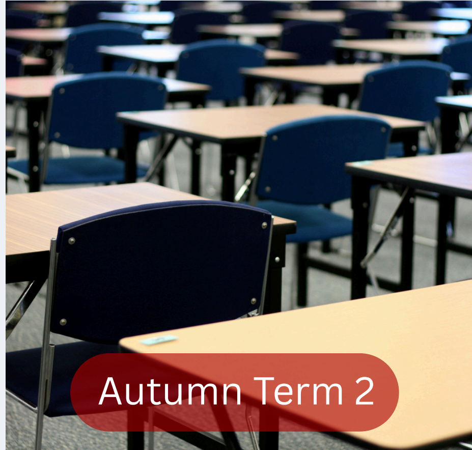
Autumn Term 2